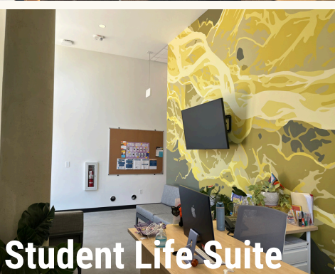
Student Life Suite