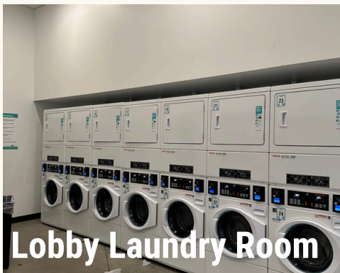
Lobby Laundry Room