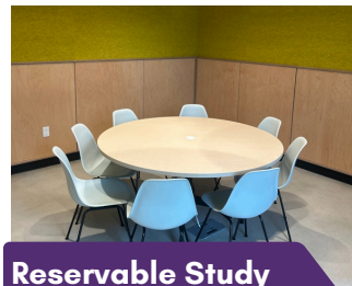
Reservable Study Rooms

Located on the second floor of Survivance Hall